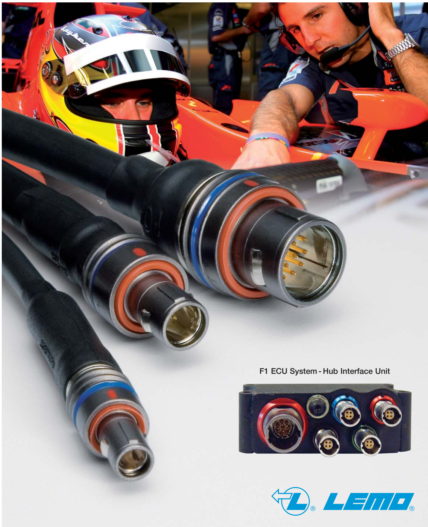
F1 ECU System - Hub Interface Unit